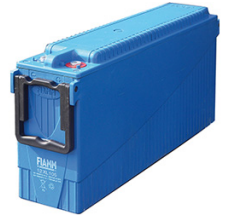
2 x 12V/80Ah@C10