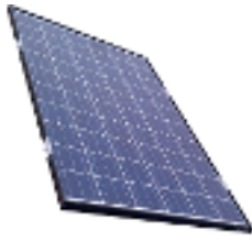
1 x 250W